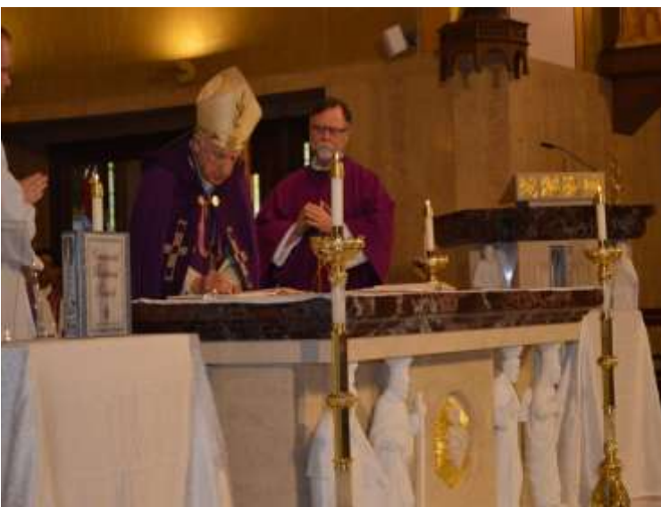
Rite of Election

In places like Haiti and Serbia CRS not only hands out aid directly, but, by investing in people and strengthening institutions, enables local groups to lead in their own development, increases the impact of joint programming, and produces sustainable solutions. A real work of mercy!