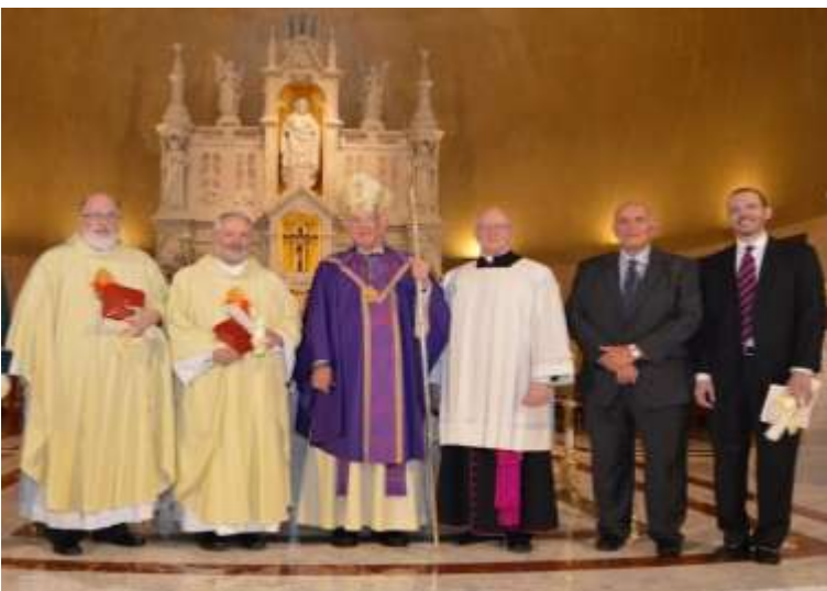
Papal Honors Mass

SHGS is accepting applications for registration for the 2018-2019 school year with some spots still available in our classrooms, preschool through 5th grade. Please visit our website, shgs.us , or call the school office at 304-346-5491 for more information.