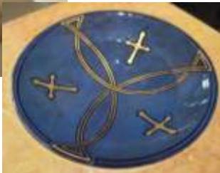
The new glass bowl for the Baptismal Font