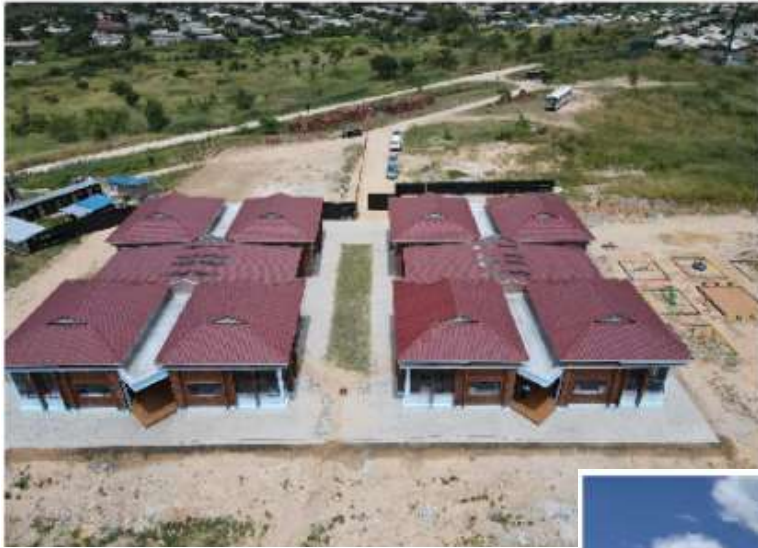
Our Lady of Perpetual Help School Primary School in Chinhoyi Zimbabwe