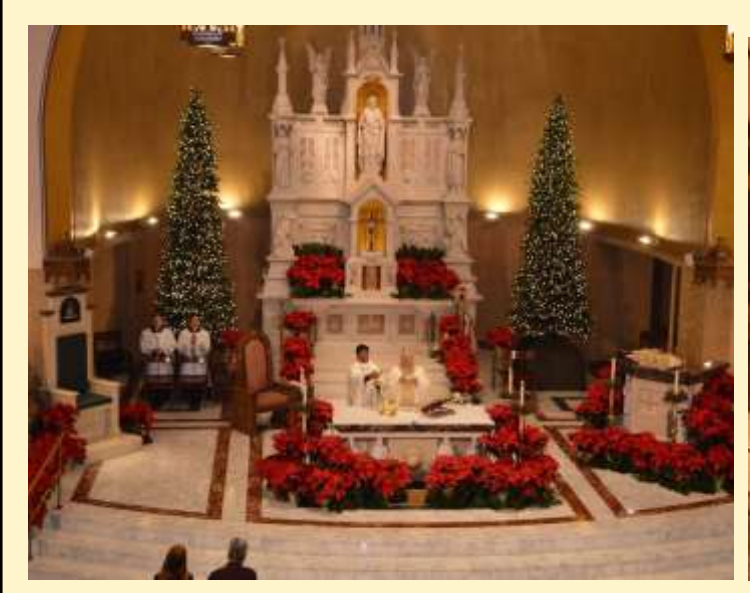
Christmas Eve-8:00 PM Mass

We thank God for the gift of your time and talent!