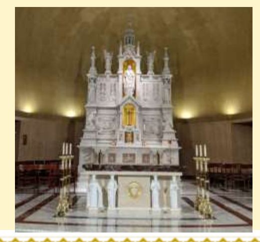
SACRED HEART CHURCH - 1895